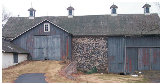
The Haskell's Barn, which was the set of M Night Shyamalan's 2004 film 'The Village' will also be the location of this year's WOW AWARDS GALA!