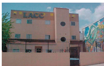
The Latin American Community Center is located at 403 N. Van Buren St. in Wilmington. For more information, visit the LACC Web site at www.thelatincenter.org .

daycare, rapid HIV testing, senior services and job placement just to name a few. Everything at the Center is offered in both English and Spanish, and there are staff members that represent dozens of Latin American countries.