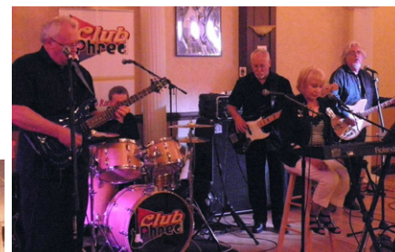
Former Red Ribbon awardee, the group Club Phred provided entertainment at this year's WOW!