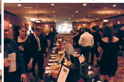
Guests check out more than 250 silent auction items, and enjoy fabulous food in the ballroom.