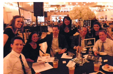
Our friends from Iron Hill Brewery!