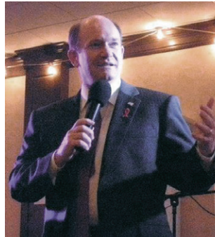
U.S. Senator Chris Coons stopped in at WOW again this year.