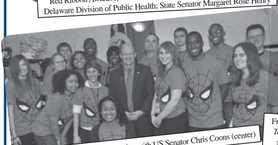
Volunteers from Widener University, with US Senator Chris Coons (center)