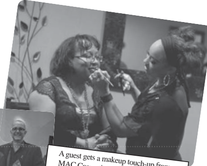
A guest gets a makeup touch-up from a MAC Cosmetic's makeup artist. Many thanks to the MAC at Christiana staff!