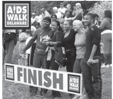
Participants at the 2010 AIDS Walk in Wilmington