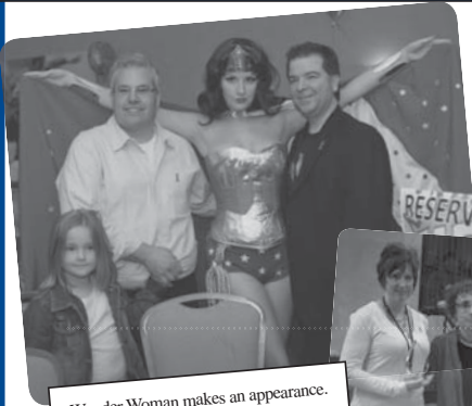
Wonder Woman makes an appearance.