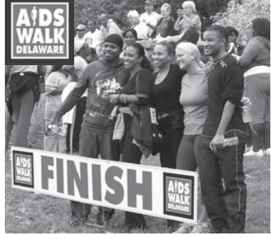
Participants at the 2010 AIDS Walk in Wilmington

"In the fall of 1986, about 36 people participated in the inaugural Walk that looped around downtown Wilmington. This landmark year will keep the integ-(Continued on page 5)