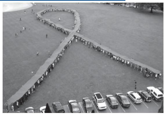
Walkers in Wilmington raise 258 feet of fabric in the form of an AIDS Awareness Ribbon, in an attempt to break a world record.

Attendance was slightly lower than last year in Dover but the enthusiastic walkers were warmed-up with a pre-walk stretch by the Delaware State University women's basketball team. A special thanks goes to the Department of Public Health and the John Wesley AME Church's walk teams that led the pack in raising the